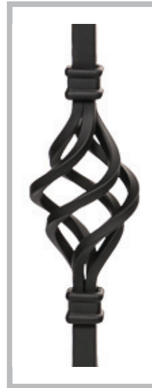
1BASK36 ** 1BASK44 *