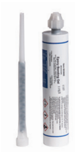
C-2901 11 oz. Slow Cure Epoxy 20-30 minute work time