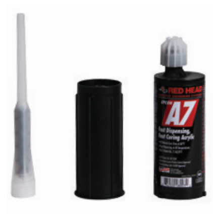
A-501-K Fast Drying Epoxy 5-7 minute work time

* Kit includes 5 oz. A-7 epoxy, A-24 nozzle and piston for use with standard caulking gun. (caulking gun not included)